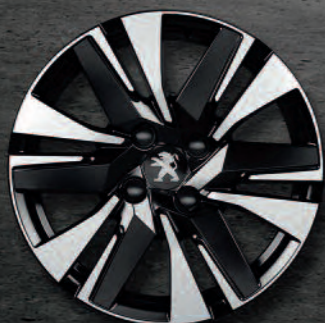
16" 'Aquila' Alloy Wheel