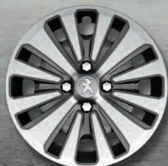
16" Steel Wheel with 'Stronium' wheel trim