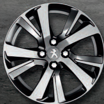
17" 'Eridan' Anthra Alloy Wheel