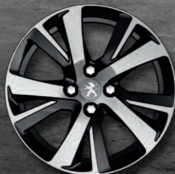
17" 'Eridan' Brilliant Black Alloy Wheel