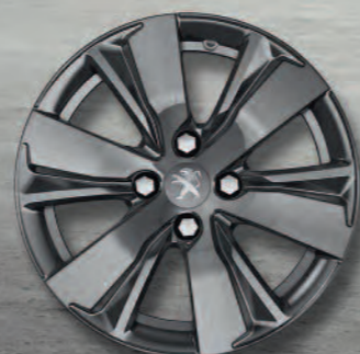
16" 'Hydre' Alloy Wheel