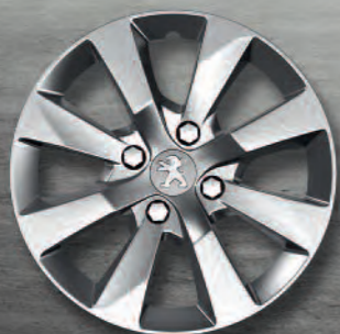
15" Steel Wheel with 'Iode' wheel trim