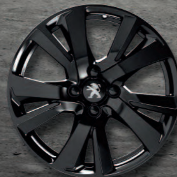
17" 'Eridan' Black Alloy Wheel