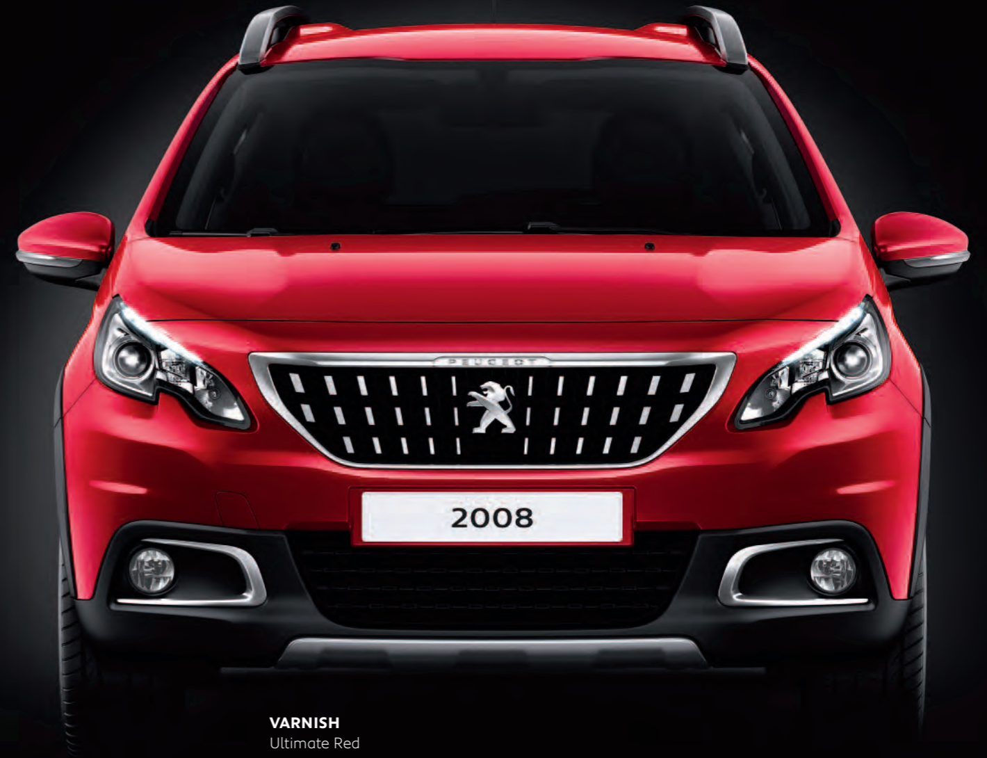
VARNISH Ultimate Red

*Colours available according to version.