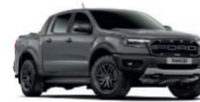
Conquer Grey Premium body colour* (Ranger Raptor only)