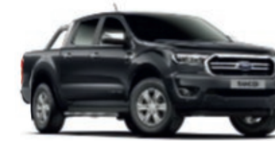
Shadow Black Premium body colour*