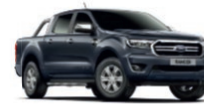
Sea Grey Metallic body colour*