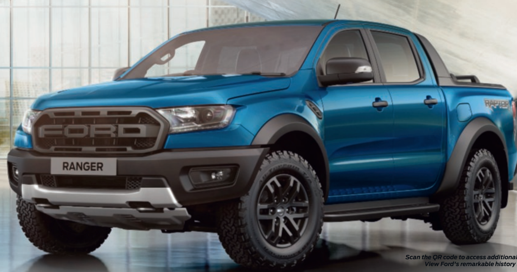
Above: Model shown is a Double Cab Ranger Raptor in Ford Performance Blue metallic body colour (option).

Scan the QR code to access additional content. View Ford's remarkable history in action.