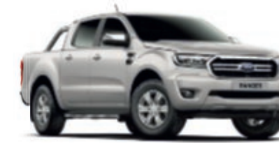
Moondust Silver Metallic body colour*