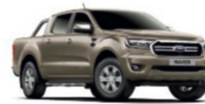
Diffused Silver Metallic body colour*