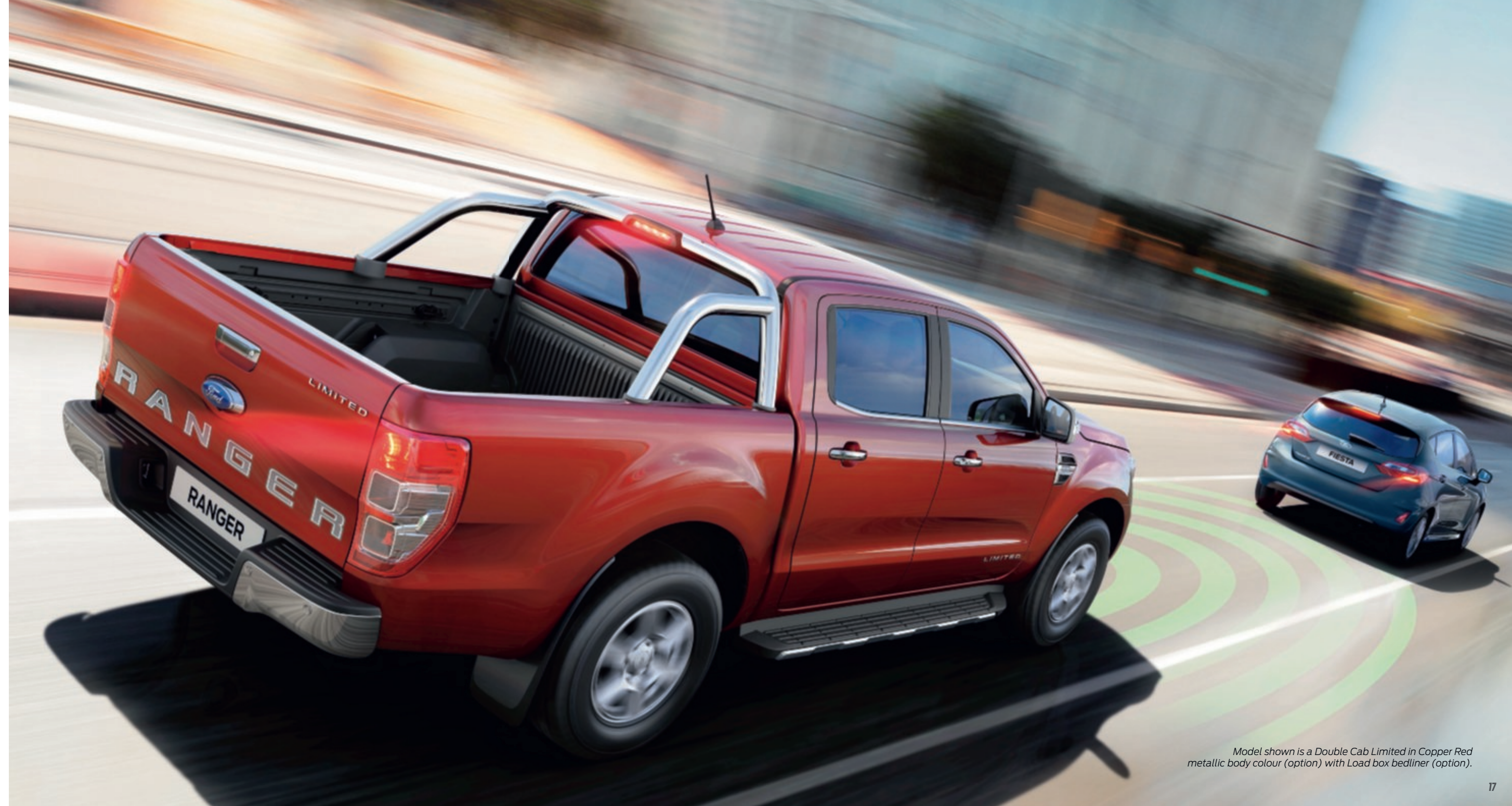
Model shown is a Double Cab Limited in Copper Red metallic body colour (option) with Load box bedliner (option).