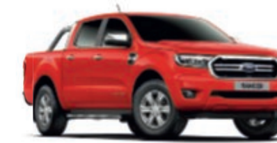
Colorado Red Solid body colour