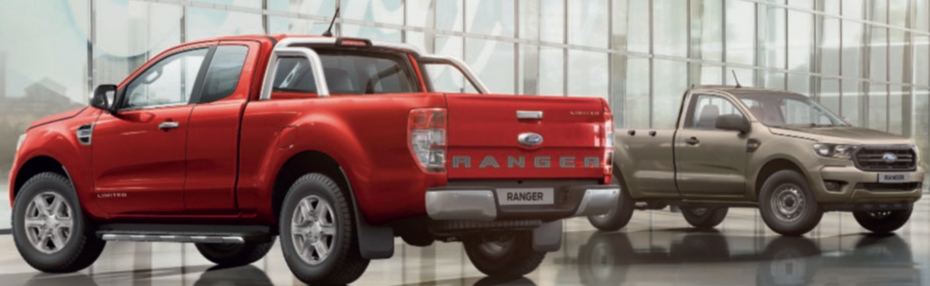
Left: Model shown is a Super Cab Limited in Copper Red metallic body colour (option).