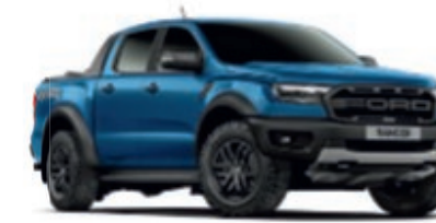
Ford Performance Blue Fashion Metallic body colour* (Ranger Raptor only)