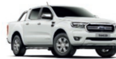
Frozen White Solid body colour