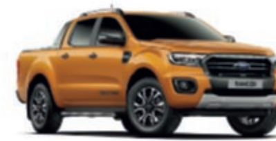
Sabre Orange Fashion Metallic body colour* (Wildtrak only)