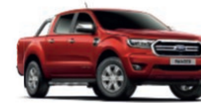
Copper Red Metallic body colour*