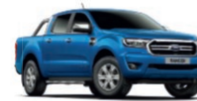
Blue Lightning Metallic body colour*