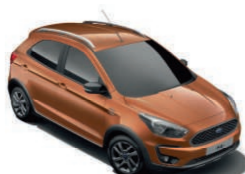
Canyon Ridge Exclusive body colour†