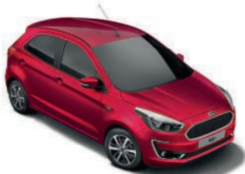
Ruby Red Exclusive body colour*