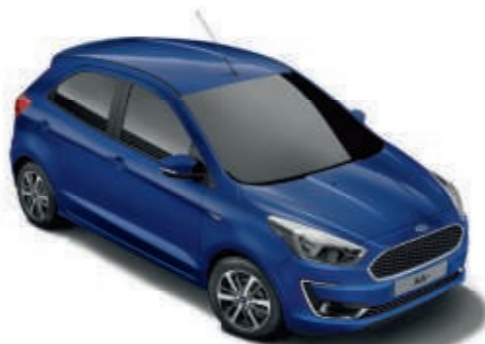
Deep Impact Blue Premium body colour*