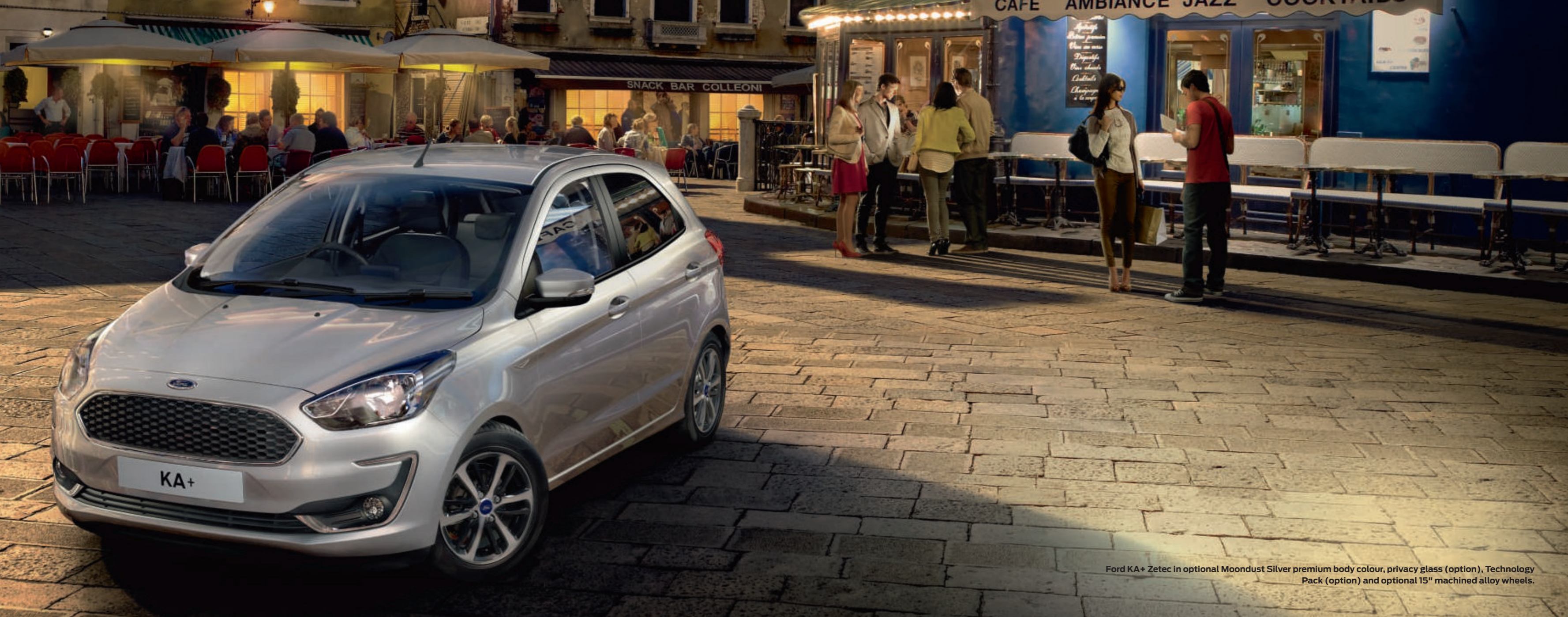
Ford KA+ Zetec in optional Moondust Silver premium body colour, privacy glass (option), Technology Pack (option) and optional 15" machined alloy wheels.