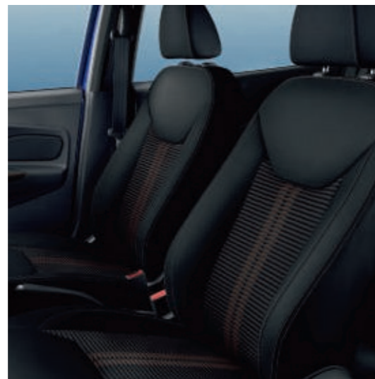
Verge in Sienna Hazel