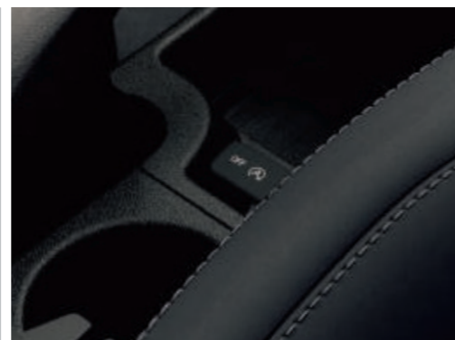
■ Auto Start-Stop (Standard)