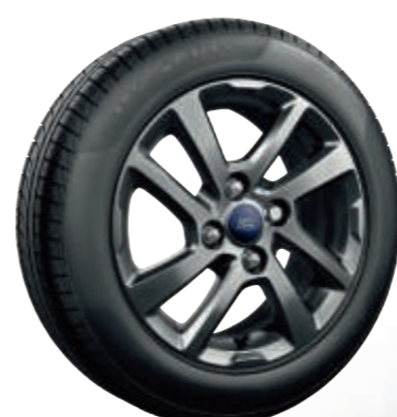
15" 15" 4x2-spoke grey-finish alloy wheels (Fitted with 185/60 tyres) (Standard on Active)