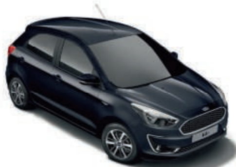
Shadow Black Premium body colour*