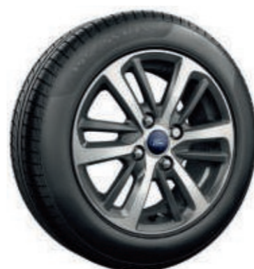
15" 5x2-spoke machined alloy wheel (Fitted with 195/55 tyres) (Option on Zetec)