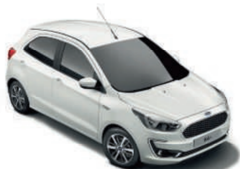
Oxford White Standard body colour