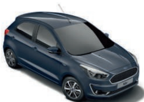
Smoke Grey Premium body colour*