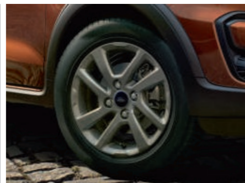
■ 15" 4x2-spoke grey-finish alloy wheels (Standard)