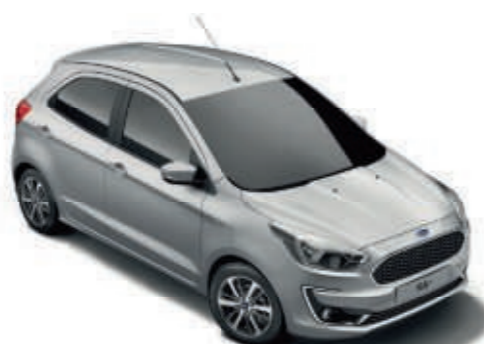
Moon dust Silver Premium body colour*