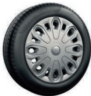
15" steel wheel with 8x2-spoke wheel cover (Fitted with 195/55 tyres) (Standard on Studio)