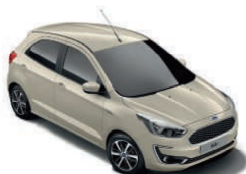
White Gold Premium body colour*