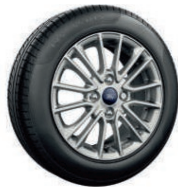
15" 16-spoke alloy wheel (Fitted with 195/55 tyres) (Standard on Zetec)