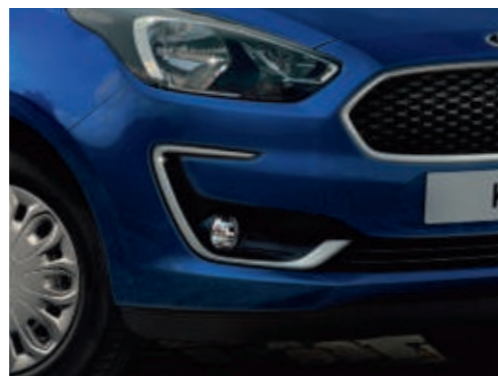
■ Front fog lights (Standard)