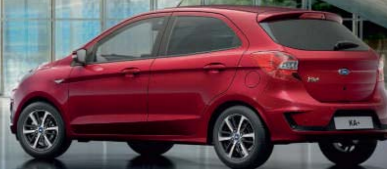
KA+ Zetec with Ruby Red exclusive body colour and 15" machined alloy wheels (options at extra cost)