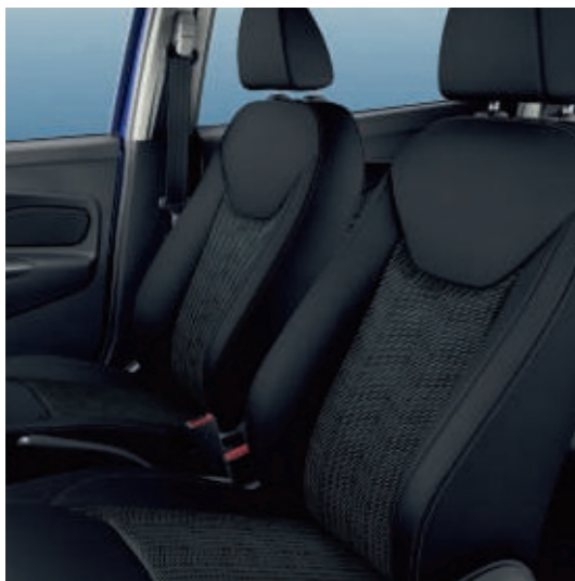
Lodha in Charcoal Black

The look and feel of interior materials plays a large part in appreciating the overall driving experience. That's why great care has been taken in designing and crafting the trim for your Ford KA+.