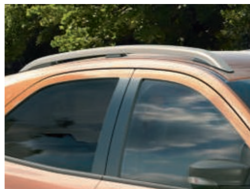
■ Silver-finish roof rails (Standard)