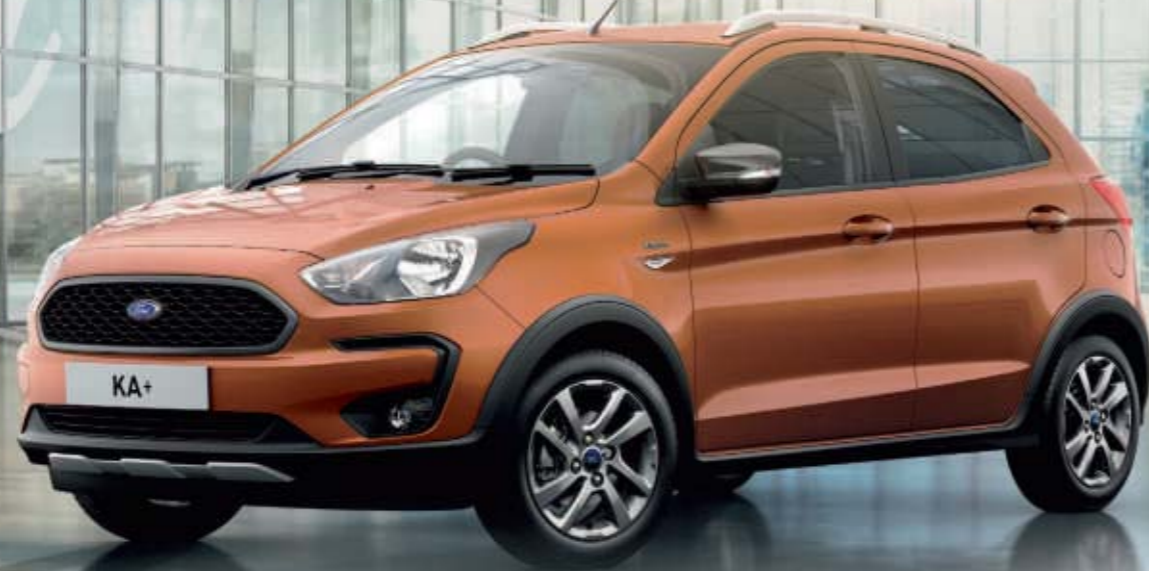
KA+ Active with Canyon Ridge exclusive body colour (option at extra cost) and 15" grey-finish alloy wheels